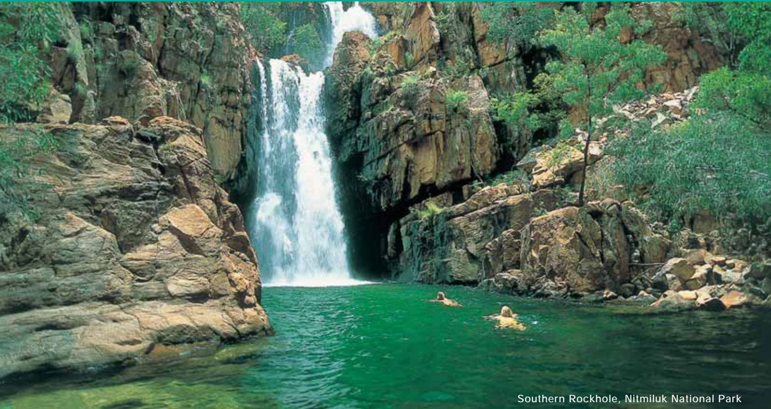
Southern Rockhole, Nitmiluk National Park